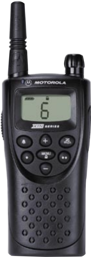
XTN Series Business Two-Way Radio