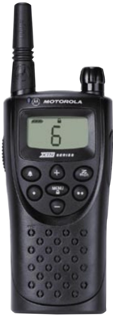
XTN Series Business Two-Way Radio